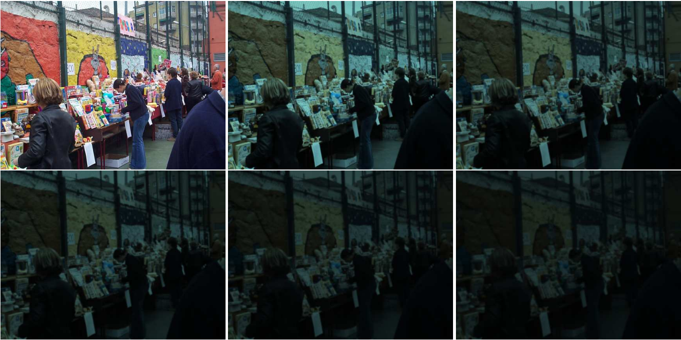
Figure 4. Some night scenes with decreasing values of ambient luminance: 1, 0.6, 0.3, 0.1 and -0.1 \log cd/m^2 , 5, 8, 10, 11 and 15 iterations of diffusion respectively from left to right and from top to bottom.