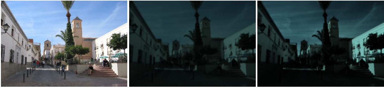
Figure 2. Original scene (left), emulating night vision (middle), emulating film (right).