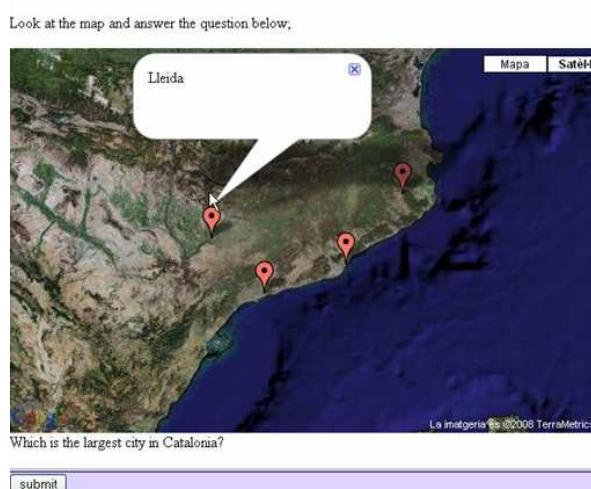
Figure 3: Screenshot of Google maps integrated in an IMS QTI item

IMS LD can be jointly used with IMS Question and Test Interoperability (IMS QTI) to incorporate test-based assessment. GTI has extended the existing support to enact QTI tests and is currently integrating this support into an LD runtime system (Blat et al., 2007). Moreover and with the aim of providing new forms of exploration and interaction beyond those provided by QTI, GTI has proposed to integrate Web 2.0 services with QTI items. As a first example, GTI has developed a QTI assessment engine enhanced with web maps from Google Maps (Bouzo et al., 2007). The system enables the user to interact with the map to answer questions, providing a more natural interface for geographic information. The concept of map interaction has been introduced to represent the different ways of processing the student actions on the map. Depending on the selected map interaction, different spatial operations are applied to validate the correctness of responses (see Figure 3.)